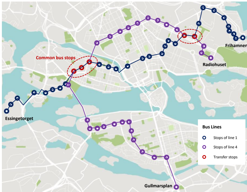
Fig. 1 Transfer stops between bus line 1 and bus line 4 in Stockholm

performance on minimizing the objective function and its computation time was only 27 minutes. The simulated annealing method was even faster than the sequential hill climbing, but had the worst performance compared to the other methods.