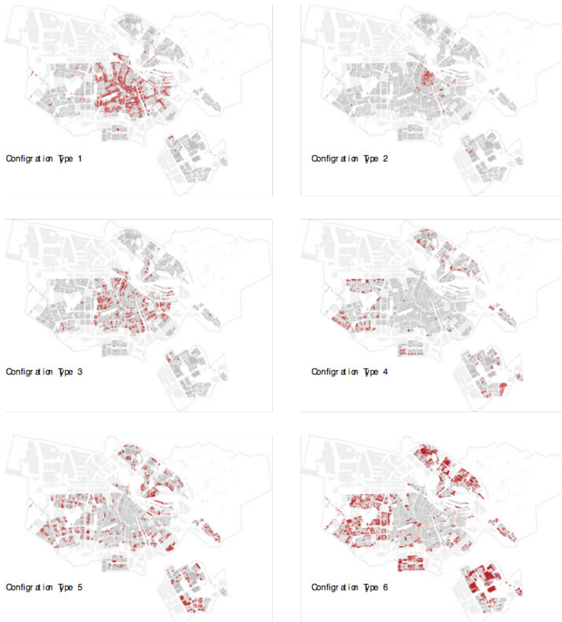
Figure 4 - Overview of the individual configuration types of Amsterdam and their geographic distribution

Some of the types clearly concentrate in certain parts of the city such as type 1 which dominates the areas built until the beginning of the 20th century. Although this concentration of the configuration type is visible, we can find this type of configurations also in all other districts of the city. The same is valid for the other configuration types.