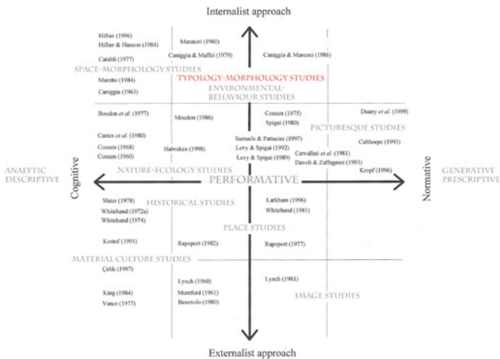
Figure 1 - An overview of the categorization of urban morphology research where typo-morphology, amongst others, is suggested to bridge between analytic/descriptive and generative/prescriptive research; freely based on Gauthier and Gilliland (2006, p. 46), Moudon (1992) and Berghauser Pont and Marcus (2015).

The typological approach presents great potential as it enables to include the complexity of the urban landscape both in terms of character and scale. Recent studies have shown the success of such approaches, e.g. Berghauser Pont and Haupt (2010), Gil et al. (2012), Barthelemy (2015). This is important for two reasons: First, to analyse urban conditions in its full complexity or, in other words, to evaluate the spatial characteristics and distributions in a city at all scales that, in turn, can accommodate diverse needs. Second, to inform urban development. It is especially here, typologies can be so powerful, because they enable to bridge between research and practice and we can make the full complexity of the urban landscape accessible for professionals in urban planning and design.