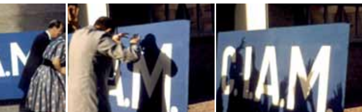
The Death of CIAM, stills from the 16mm film by Jaap Bakema