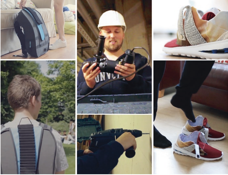
Fig. 3.2 Image showing Pat the social backpack (left), Harry the power drill (middle) and Waggle the shoe (right)