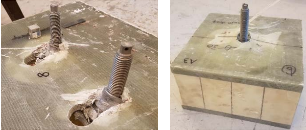
Figure 2. Typical failure pattern of Ajax connector in push-out (left) and pull-out (right) tests

Delamination of FRP was the dominant failure mode in the specimens with blind bolted connectors (Figure 2). Values in Table 1 show peak load before delamination which is followed by sudden 20-30% drop of force. The Ajax and Lindapter showed force recovery after delamination resulting in ultimate resistances (values in parentheses) at approx. 20 and 30 mm axial displacement respectively. Failure mode of the injected connector was by deboning at interface between SRR and embedded connector without delamination resulting in very good resistance to "first crack" of this connector compared to the other two.