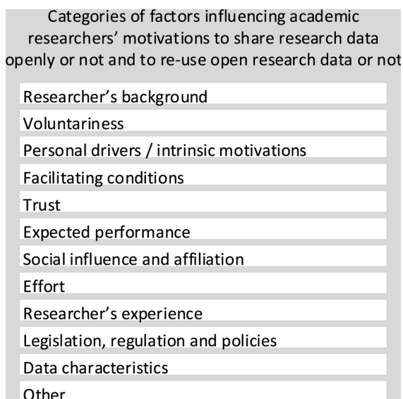
Fig. 1. Conceptual model of factors influencing academic researchers' motivations to share and re-use open research data or not (derived from Zuiderwijk, 2019; Zuiderwijk & Shinde, unpublished).

a contemporary phenomenon within its real-life context, especially when the boundaries between phenomenon and context are not clearly evident" (Yin, 2009, p. 13). Case studies are useful for investigating various broad and complex real-life contemporary events which require a holistic and in-depth examination (Dubé & Paré, 2003; Yin, 2009). Case study research is particularly appropriate for problems in which experiences of actors and the context of action play an essential role (Benbasat, Goldstein, & Mead, 1987; Bonoma, 1983).