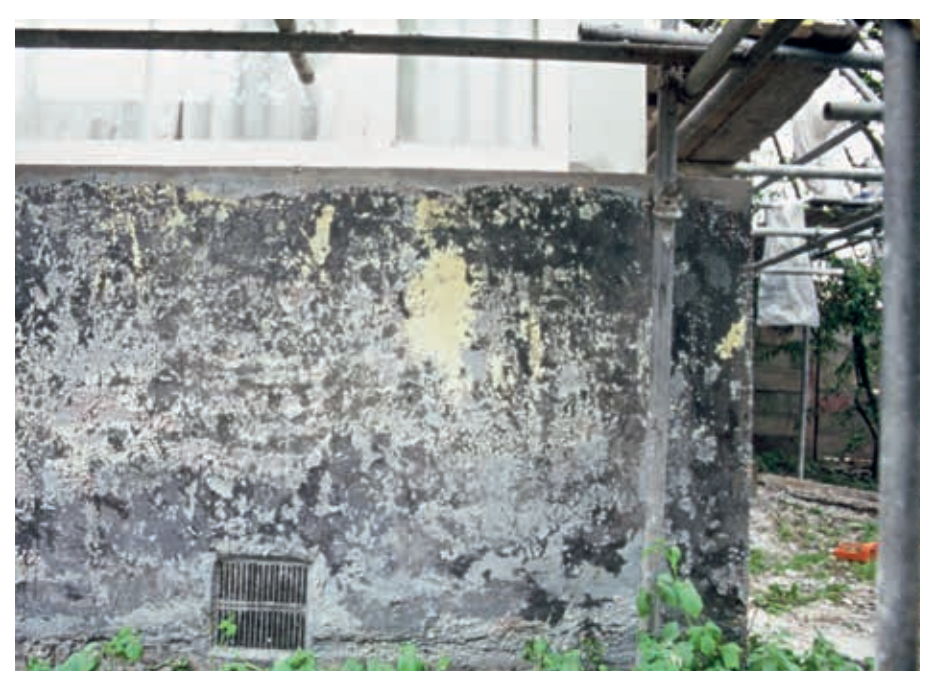
10. Various shades of grey came to light on the window below the kitchen window. Bertus Mulder based the grey for this surface on the dark grey in the top right corner