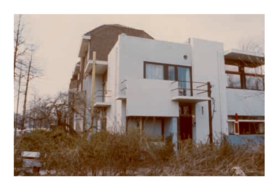
3. Just before the restoration the Rietveld Schröder House, the grey values and intensity of the exterior colour scheme were scarcely discernible; moreover, the greys had acquired a 'bluish' tinge (Rietveld Schröder Archive, CMU)