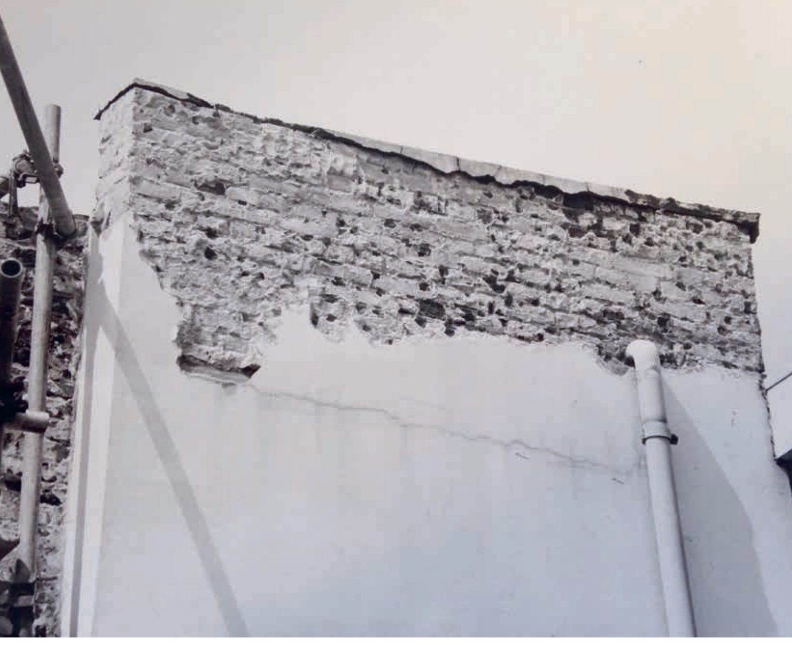
7. Only the render on the upper part of the white wall beside the front door of the Rietveld Schröder House was chipped away in 1979