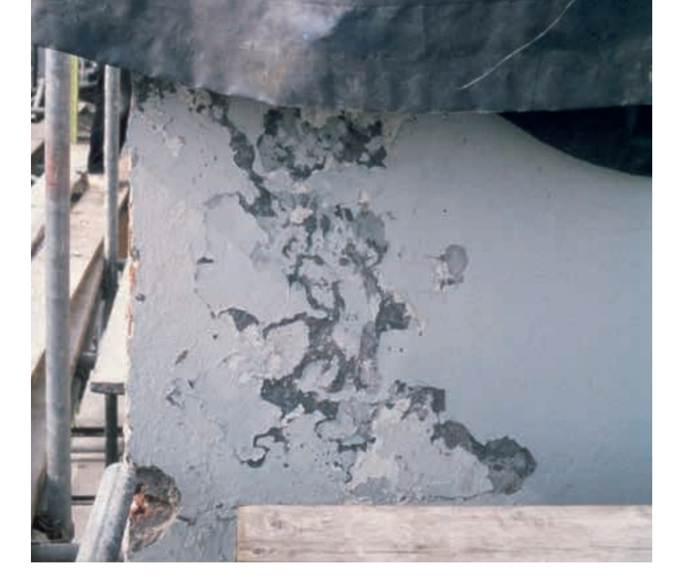
9. In several places, such as here on the chimney, Bertus Mulder discovered various remnants of render and finish coats