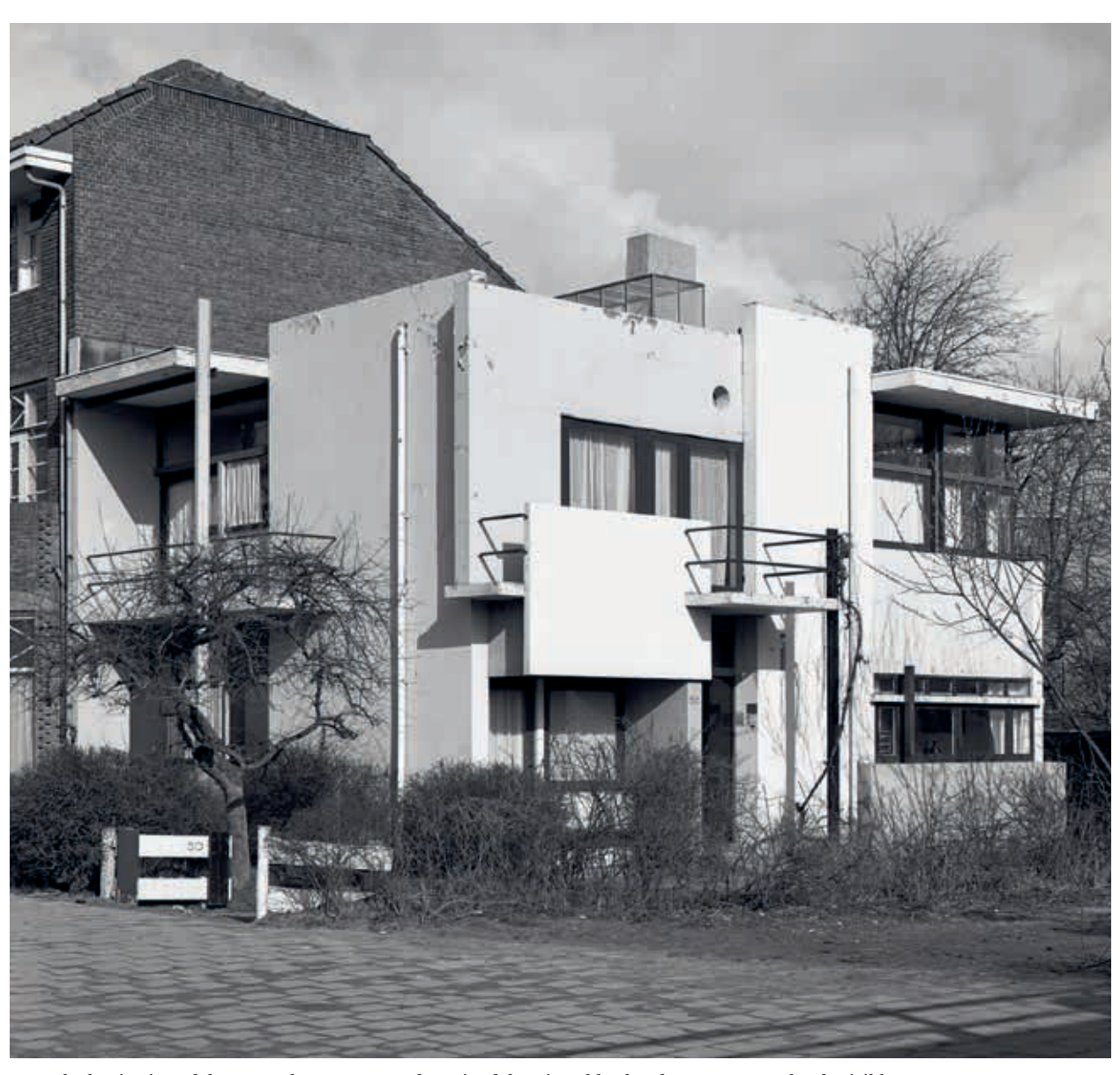
2. At the beginning of the 1970s the poor state of repair of the Rietveld Schröder House was clearly visible