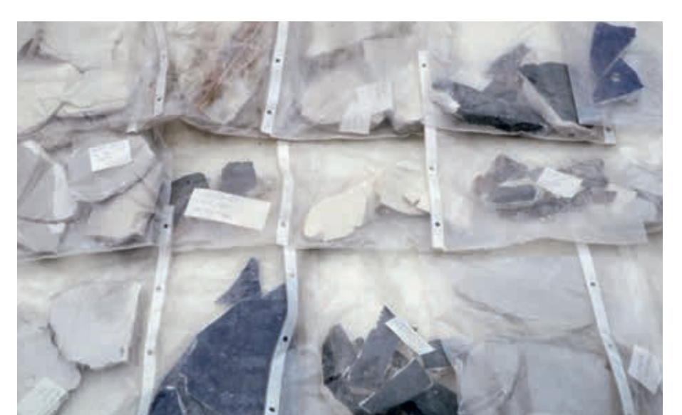
11. Samples of render and colour were initially collected and sorted for the colour research; afterwards they were thrown away