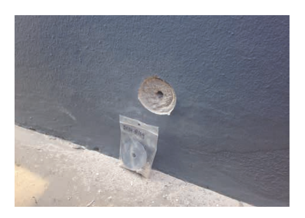
17. In 2018 TNO and Stichting Restauratie Atelier Limburg took samples from specific areas of the exterior and the interior of the Rietveld Schröder House. The photograph shows a sample from the balcony wall on the east elevation

A study of the house's museum interior found that there was no clear-cut interior design plan. Bertus Mulder also played a major role in the layout and furnishing of the museum house. Meticulous comparison of photographs from different historical periods yields a picture of a furnishing concept that was not always consistently applied, but from which the occupational history was rigorously excluded.<sup>48</sup> Truus Schröder did not want to be visible in the house after her death. Yet it was her house, she was the client and she lived in the house for sixty years (fig. 18). Below the photograph in De Stijl , her name was alongside that of Rietveld and at that time they had a joint practice,