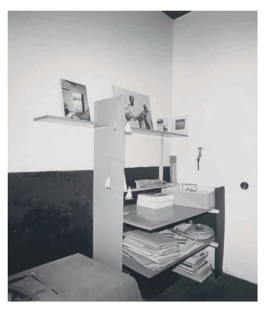
16. The south wall of the study on the ground floor of the Rietveld Schröder House, undated historical photo

Much has already been written about authenticity, in particular with regard to modernist architecture and the reconstruction of modern heritage. 44 The acceptance of the reconstruction of ideas and design principles as an authentic intervention is a welcome and useful legitimization where the reinstatement of the original materials or constructions is virtually impossible. But it is also at odds with previously mentioned principles aiming at conserving a monument together