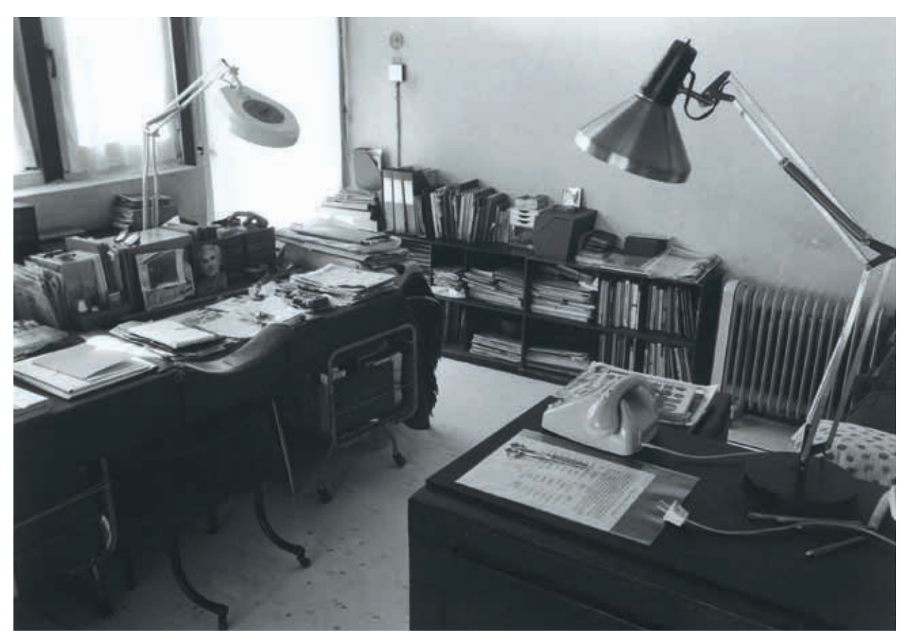
18. Interior photograph of the upper floor of the Rietveld Schröder House in the 1970s; the objects are indicative of the way Truus Schröder lived in the house at that time

Rietveld & Schräder. Mulder's restorations were clearly influenced by Truus Schröder. But Schröder's role in the design and furnishing of the house, as also her part in the rest of Rietveld's oeuvre, has yet to be fully researched.<sup>49</sup>