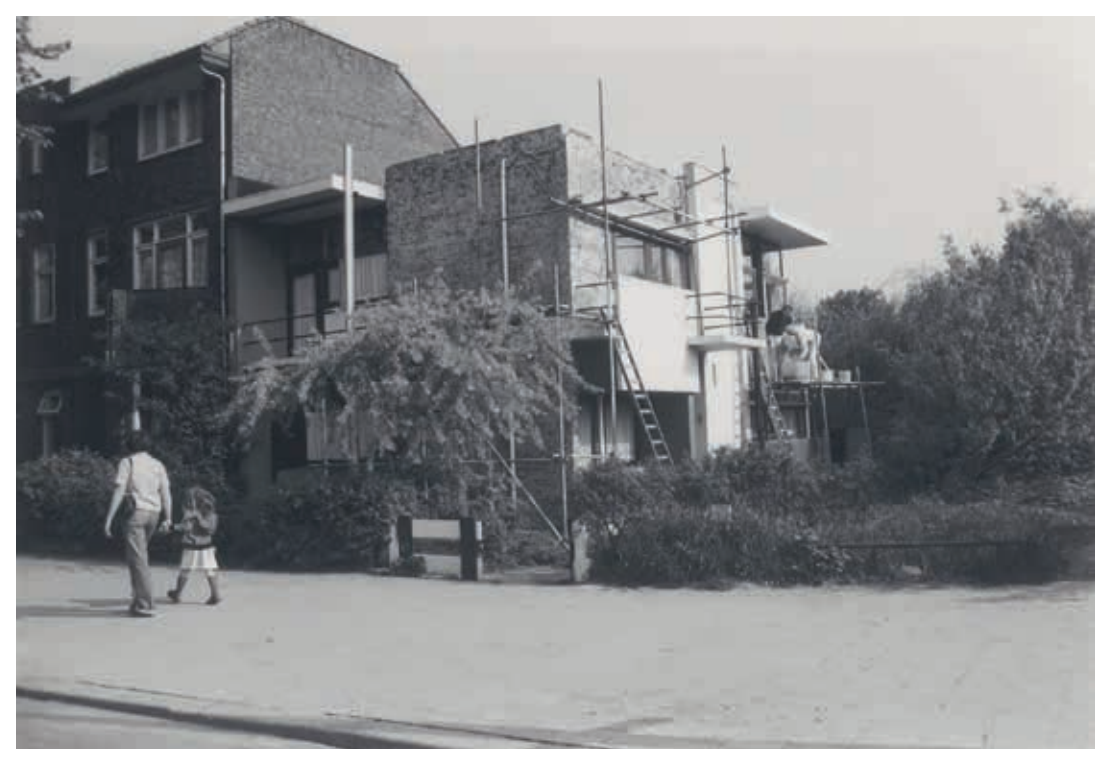
5. In 1979 the Rietveld Schröder House was once again scaffolded after the reappearance of the problems with the plasterwork. Large areas of render were first chipped away, after which a new coat was applied