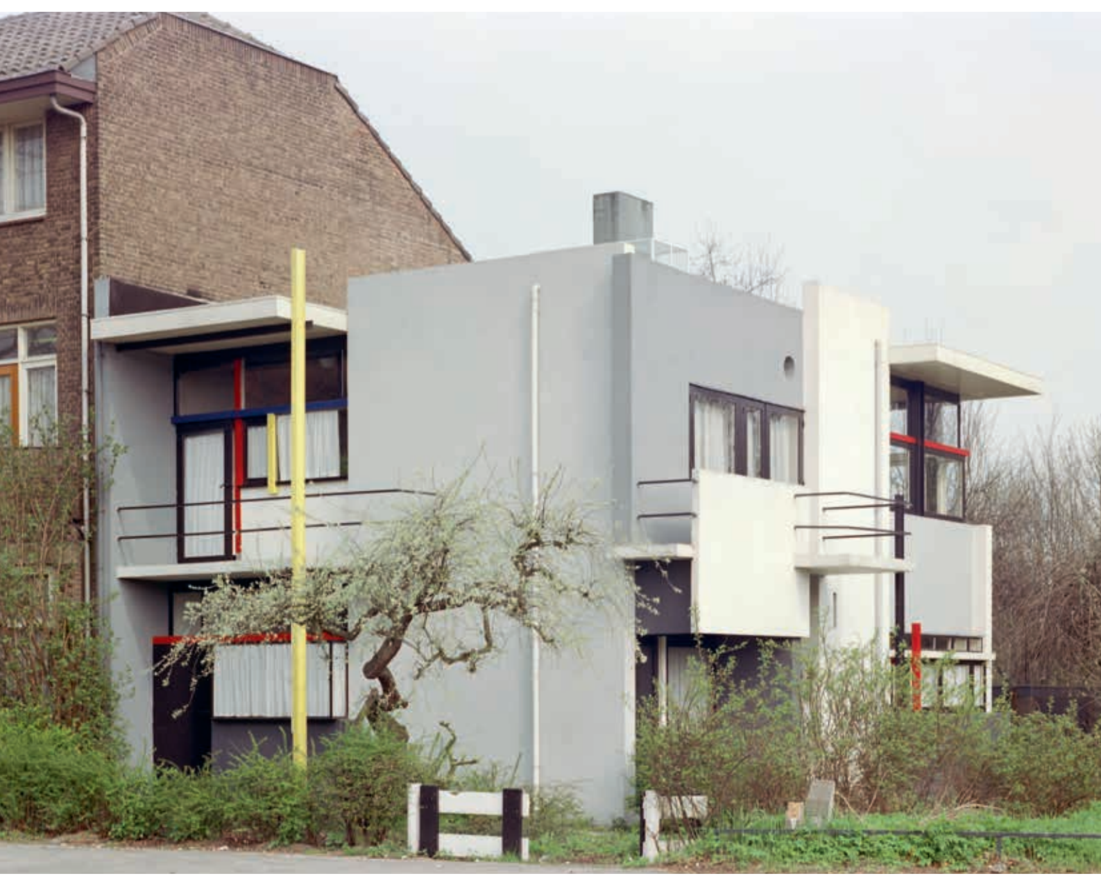
8. The exterior of the Rietveld Schröder House in a new colour composition to a design by Bertus Mulder, photo 1981

repainted. According to Mulder, the walls were supposed to be repaired and repainted every five years. New coats of paint were then applied over the existing ones or, if the paint layers were too thick they were sometimes removed.<sup>27</sup> An examination of the historical photographs of the Schröder House from the period 1925-1975 confirms that over the years, the house had started to look quite different and that the composition and colour intensity of the various grey and white walls varied.