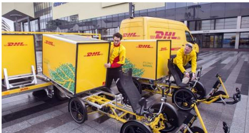
Figure 3: DHL cubicycle in operation

DHL is a leader in the deployment of bicycles in its network. The Cubicycle is a bicycle on four wheels with a detachable container of a cubic meter, the size of a Euro pallet of 80x120x100 centimeters. This makes it easy to integrate into the standardised transport process. The most important advantages compared to other bicycles are the content and better connection to the operational systems. The Cubicycle was built by Velove from Sweden and has electric pedal assistance, in particular to get going in the first few meters. The Cubicycle runs smoothly, is surprisingly agile and has a short turning circle. Despite the large container, the bike fits perfectly on the bike paths. For example, the standard dimensions of posts on a cycle path have been taken into account. The height of the bicycle is also chosen in such a way that other cyclists can easily look over it. That is how the Cubicycle distinguishes itself from existing high-volume bicycles. The big difference with the other 40 bikes that DHL uses in Dutch city centres is that larger packages can also be taken along. Compared to the Parcycle (parcel box bike) and certainly in comparison with the backpack on the regular bike, the container of the Cubicycle offers much more space. On an average journey, it is loaded with 125 kilos of shipments and the bicycle courier travels about 50 km a day.