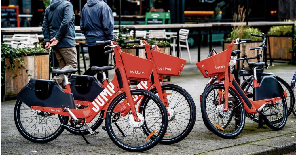
Figure 5: Example of bike sharing