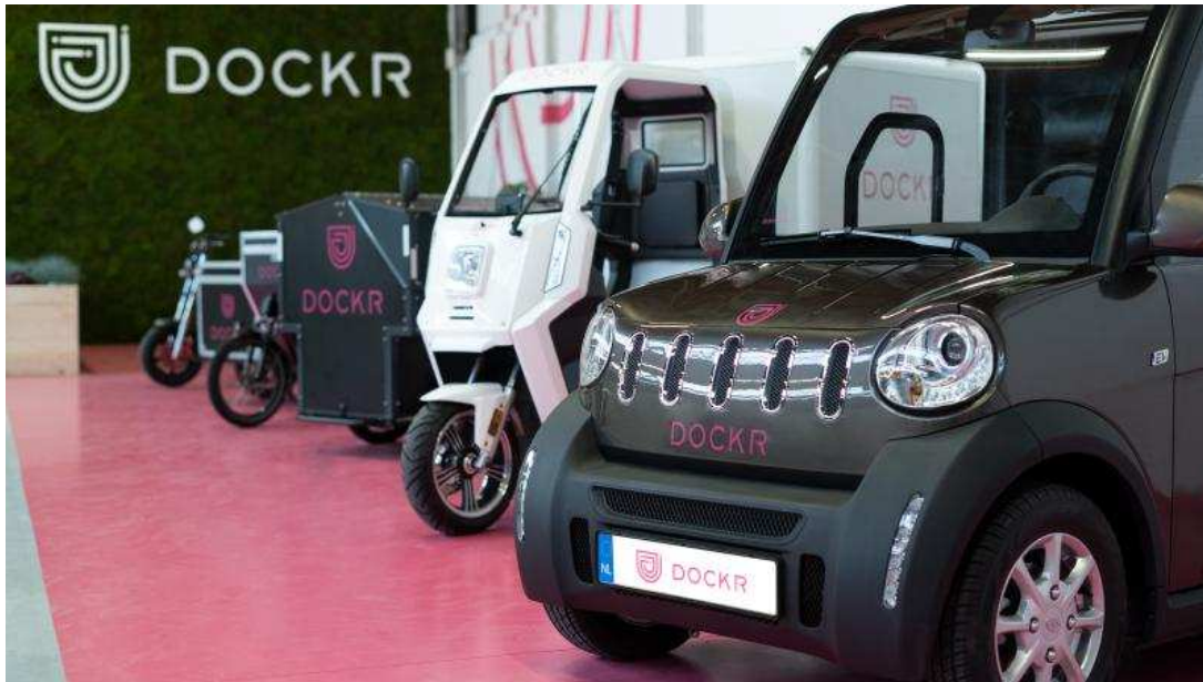
Figure 4: Rental Light Electric Freight Vehicles of Dockr.

Another important supplier of cargo bikes is Velove from Sweden (contact person: Johan Erlandsson). They developed the bikes for the DHL operations. The cargo bike carries up to 300 kg and 2 m 3 and is designed to work well on bike lanes, with its width that is smaller than family cargo bikes. In the world they have customers in 20 countries and relationship with a number of big brands.