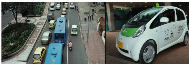
Figure 2: Mobile environmental laboratory for air quality measurement (Project Indevos)

To measure and visualise the current air quality in Bogota is one of the challenges of the research team Indevos . It is a research and development group of the EAN University whose mission is to accelerate sustainability and innovation in Colombia. At this moment they are collecting real time measurement of the air quality in several areas of Bogota by the use of mobile environmental laboratory (Mitsubishi, see figure 2). Knowing and showing this type of data is the first step to a better understanding of the air quality in Bogota. It is a necessity to create more sustainable awareness!!