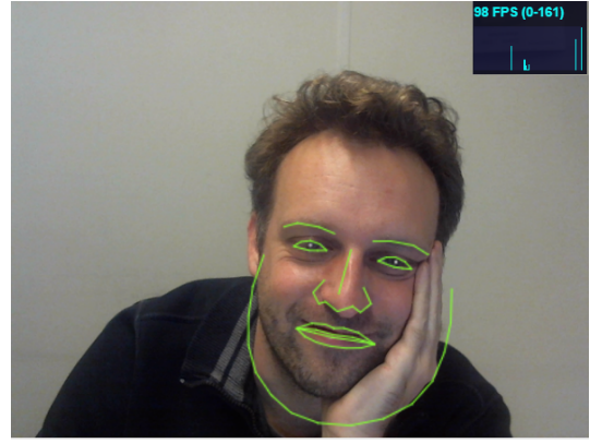
Figure 1. Face fitting model used by Clmtrackr; also shows a common fitting error due to hand positioning

As a simpler alternative, we also use the tracking.js [12] 4 face recognition library (TJS in the following), which has been employed for example in security systems [6] or for general object recognition tasks [24]. With respect to eye and face tracking, this library offers a significantly less powerful feature set than both Tobii and CLM, as it can only detect the presence and location of the boundary box of faces in a video stream (see Figure 2). While it can also be used to track the location of eyes (but not the gaze), we did not use that feature in this study. We hypothesize that the simplicity of TJS leads to more reliable and stable face-miss event detection.