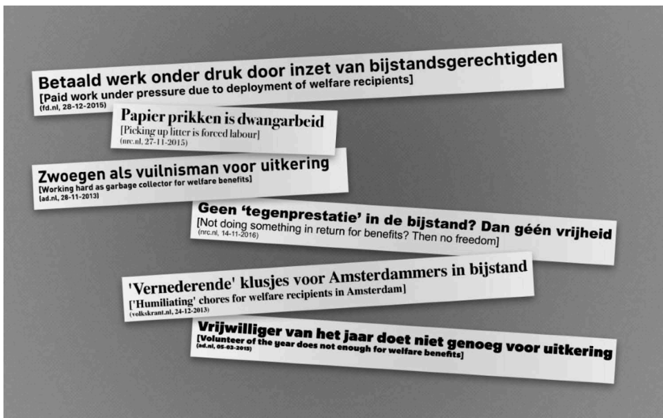
Figure 1. Newspaper headlines on welfare recipients obliged to do voluntary work.