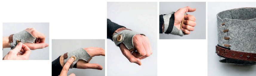
Figure 4. Relaxation training glove intended to be friendly, intuitive, and respectful. Design by Felix Quadvlieg

The sensorial and semantic appeal of the technology is important to users considering their acceptance and