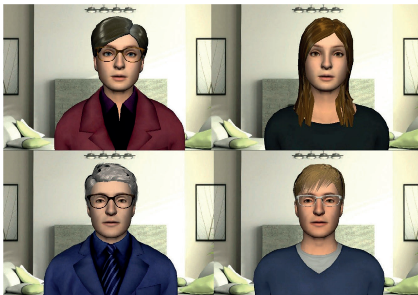
Figure 1. Four different virtual agents

Psychoeducation is an important part of exposure therapy for PTSD, as it provides information to patients about why it is helpful to confront traumatic memories. 5 In standard therapy, such information is usually presented by a therapist. A virtual agent could verbally present this information, but technology also offers other options, such as allowing patients to read the text on screen. Presentation by a virtual agent might increase trust in the agent and reading the text may allow a user to better remember the information. To study this further, an experiment was performed where participants were