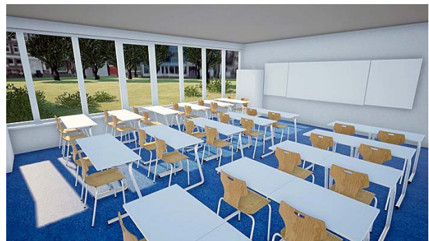
Figure 2. Virtual classroom with blue flooring and white walls.

A three-way factorial randomized design was used to test the effect of different colours of walls and floor on the thermal comfort and draught feeling in a winter situation (sunlight coming in: heat) and in a summer situation (opening window: draught) [6]. The different classroom situations (colours of walls: red, blue or white; and floor: green, grey or blue) (combination white walls and blue floor is shown in Figure 2), were created with Virtual Reality in combination with a construction lamp (simulating the heat of the sun) and a fan (simulating the draught of fresh air).