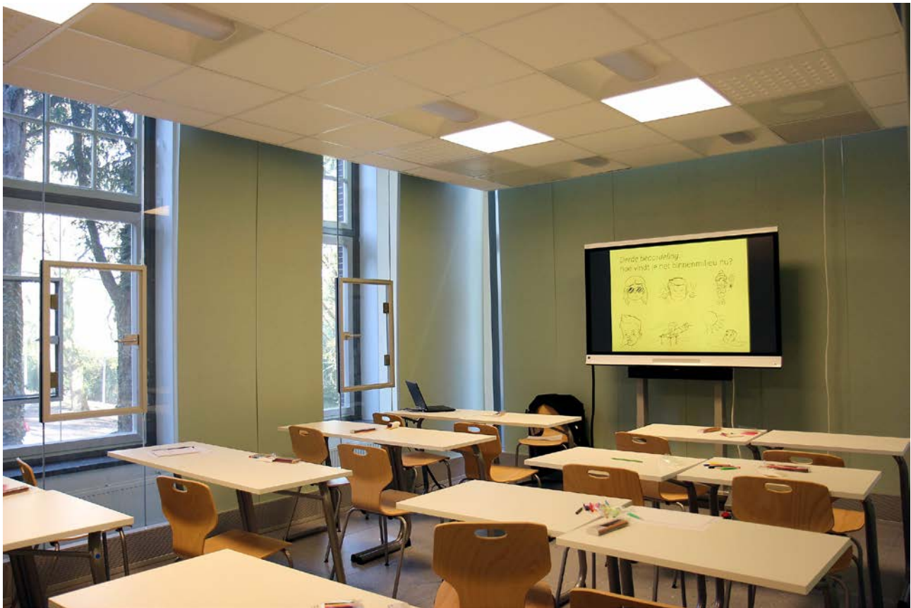
Figure 1. Set-up in Experience room (with acoustical panels and with soft light on).

The results showed a clear influence of ‘fewer’ acoustical panels on children’s evaluation of smell, draught and light. More acoustical panels had a positive effect on the children’s assessment of sound. Sound type, especially ‘children talking’, affected the assessment of both sound and smell.