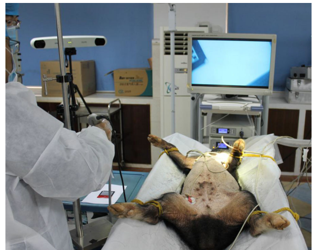
Fig. 1 Simulation of laparoscopy surgery in an animal experiment

Our animal experiment was performed on a healthy male pig weighing 25 kg, which had received full approval by the Ethical Committee on animal experimentation. The pig was fasted for 24 h with free access to water before the study. 3% of thioethamyl (1 ml/kg) was injected percutaneously in the marginal vein of the ear. The pig was orotracheally intubated and maintained in a supine position (Fig. 1). The oxygen saturation and heart rate were monitored during the study.