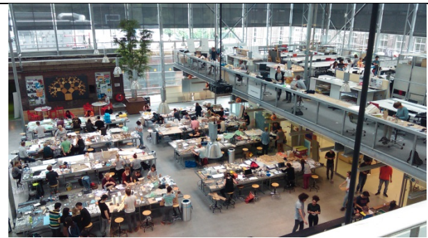
BK City, West Glasshouse: an open area to work on scale-models