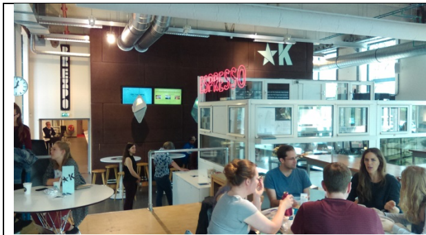
BK City, Espresso bar: a popular place to meet and greet and for learning activities

departmental domain and can also use work places elsewhere in the building. A first evaluation showed that most staff members like the current BK City building very much. However, a number of staff people complained about a lack of privacy, lack of concentration due to distraction by colleagues and phone calls, and a shortage of storage space (Gordievsky et al., 2010). These findings were confirmed in a graduation study by Van Akkeren (Van Akkeren et al., 2010) and a survey by Leesman (Bentinck and De Jong, 2012).