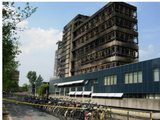
The former faculty building at Berlageweg 1, before and after the fire

After the fire, Wytze Patijn, at that time the dean of our faculty, took the opportunity to realise his dream: creating a vibrant faculty building where staff and students can easily meet in rather open environments and 'public' spaces such as huge atria, an Espresso bar, and an easy-to-access canteen in the former boiler house. It was also the start of introducing so-called activity-based workplaces. Staff members have no longer a personal desk but share a variety of work places in their