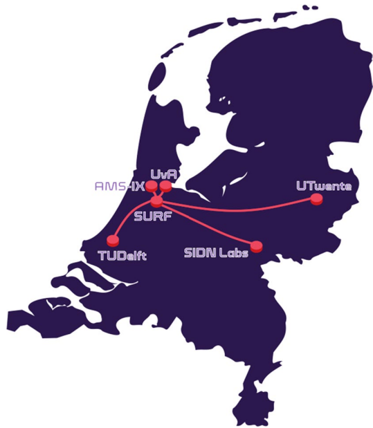
Fig. 4 Netherlands' national P4 testbed (March 2020)

recently set up the first national multi-domain P4-programmable network in the Netherlands (see Fig. 4). The testbed uses switches and NICs that can be programmed through P4. It consists of six different sites interconnected by a star-shaped optical network, which can be configured to use different topologies.