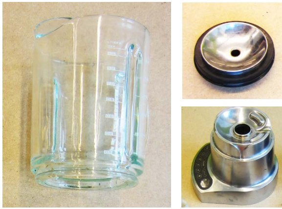
Figure 6: the three second-critical parts derived from the hotspot map: glass jug (left), the can bottom (top right) and the metal blender casing (bottom right).

part indicator. Obviously, this part is the most important part and should be easily accessible in the product architecture.