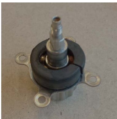
Figure 5: the axis bearing module with the worn down rubber sheath keeping it in place and protecting the bearing.

In step 12 and 17 two priority parts were addressed, the rubber sheath keeping the axis bearing module in place and the axis bearing module itself, see figure 5. Both parts are crucial for the functionality of the product, where the rubber sheath deteriorates over time because of its close contact with acid liquids dripping from the glass jug through the bearing module to the bottom motor subassembly. When the rubber sheath is deteriorated, the liquids from the jug drip slowly in the bearing, wherein the bearing is going to run rough and finally jams. Replacement of the rubber sheath should be easy to extend the life of this product.