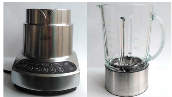
Figure 3: the Solis 837 household blender. Left the Bottom Base module and right the Top Half.

Figure 4 shows the Hotspot Map of the blender. 55 disassembly operations, or tasks, were needed to disassemble 39 parts, and in 12 of the disassembly steps, 6 different tools were needed. All parts were relatively easy to disconnect: no red flags are shown in the activity indicator column, only two yellow flags: