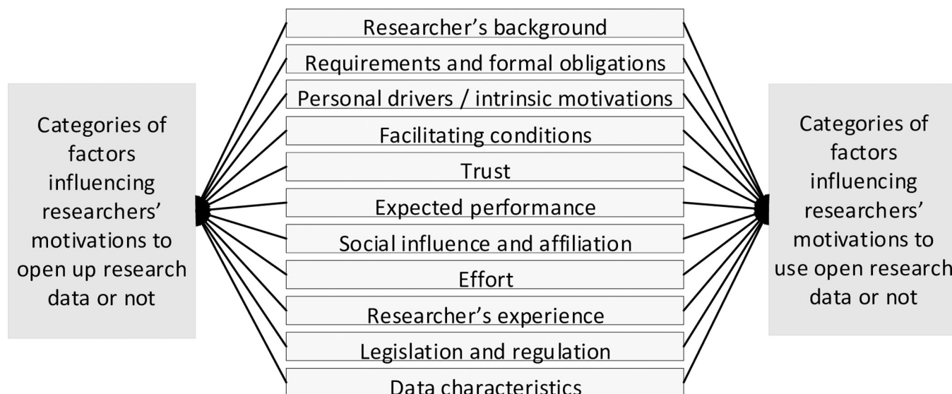
Fig 2. Categories of factors influencing whether researchers are driven or inhibited to share and use open research data.

https://doi.org/10.1371/journal.pone.0239283.g002