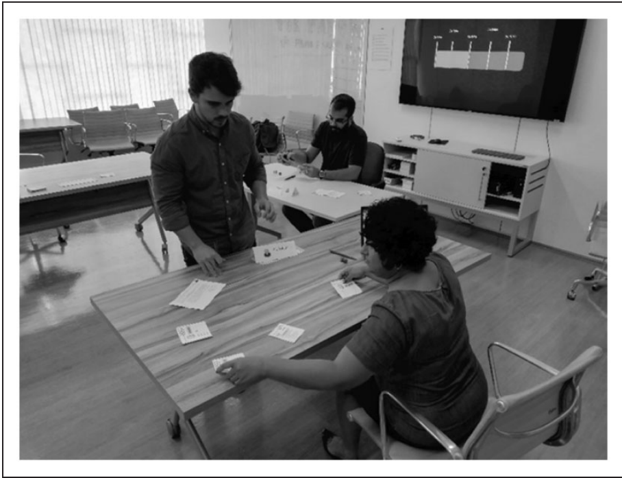
Figure 1. Play session in Brasilia.

and open data users (Wolff et al., 2017), no games have been developed specifically for civil servants to support open data release. Three prototypes were developed but failed in their learning outcomes when tested with students (Kleiman, 2019). Winning Data was used with real civil servants after successful gameplay was achieved in the academic environment (Kleiman et al., 2019) (Figure 1).