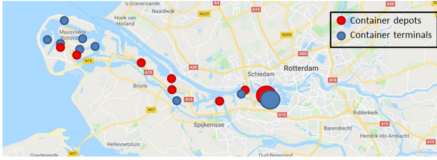
Fig. 1. Sea terminals in the Port of Rotterdam. Larger circles identify multiple close terminals. Some container terminals may also serve as container depots.