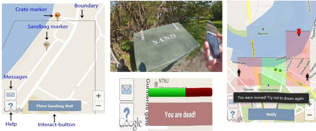
Fig. 2. Screens from FLOODED (a) main screen; (b) player placing sandbag wall; (c) player dead (d) player revived.