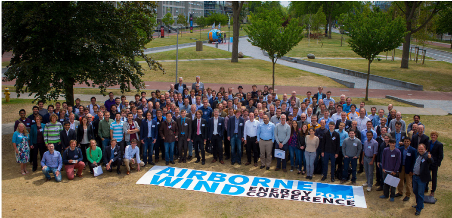
Fig. 3 Group photo at the AWEC 2015 in Delft (16 June 2015)

to produce the present, second textbook on airborne wind energy. Following the call for chapter contributions in August 2015, 33 manuscripts were received in total, of which 28 were based on conference presentations and 5 were new contributions. Because of this dominant proportion of conference material the present book can factually be regarded as scientifically expanded conference proceedings, however of a selected subset of the presented material. Each manuscript was peer-reviewed by at least two and up to five anonymous reviewers and improved within two to three consecutive review iterations. The names of the 96 reviewers are listed on the following pages xv–xvii and I would like to express my appreciation for their fast, competent and constructive feedback. Based on the recommendations I accepted 30 chapters for publication which are divided into five parts.