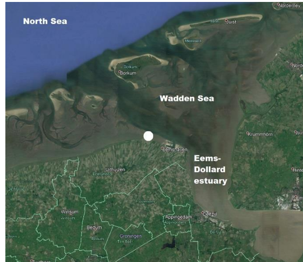
Figure 1 - The Eems-Dollard estuary in the Netherlands, area of interest of the field measurement project. Laser scanner system location indicated by white dot.

An extensive field measurement project is being performed in the Eems-Dollard estuary in the north of the Netherlands for a period of 12 years. The measurements started in 2018, measuring wind, water levels, waves and wave run-up and overtopping. The estuary consists of deep channels and shallow tidal flats and is part of the Wadden Sea, a shallow shelf sea, see Figure 1. A particular aspect for this area is that the dike design conditions are characterized by very obliquely incident waves, up to 80° relative to the dike normal. As the reliability of the models as used for the Dutch dike safety assessment has not been sufficiently validated for such conditions, the aim of the measurements is twofold. First, to better understand the processes yielding nearshore wave conditions, ultimately leading to improved numerical prediction models. Second, to better understand the processes related to oblique wave run-up and overtopping, leading to improved prediction methods. In the project, the wave overtopping is measured with four wave overtopping tanks built into dikes at two locations. The laser scanner system of Oosterlo et al. (2019) has since been upgraded and has now been placed next to two of the overtopping tanks on the dike in the Eems-Dollard estuary to measure during actual severe winter storms, see Figure 2.