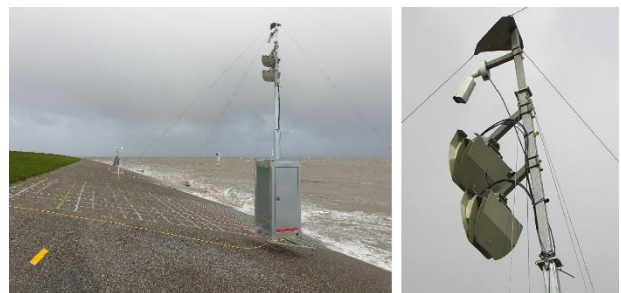
Figure 2 - Left: New laser scanner system next to the overtopping tanks on the dike in the Eems-Dollard estuary. Right: from the bottom to the top: Laser scanner 1, laser scanner 2, video camera.

The goal of the paper is to further validate this innovative system for measuring wave run-up heights, depths and front velocities, and for determining the wave overtopping, (peak) wave period and angle of incidence during an actual severe winter storm with very oblique wave attack. To this end, the paper will describe the analysis of the data obtained during storm Ciara (10 - 12 February 2020). Furthermore, the laser scanner results will be validated with data from the overtopping tanks and video recordings. Finally, the data gathered during storm Ciara will be compared to the current knowledge on wave overtopping, to possibly gain new insights in the influence of very oblique wave attack on wave overtopping.