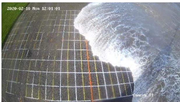
Figure 3 - Snapshot of a very oblique wave running up the slope during storm Ciara.

The focus of the paper will lie on the measurements performed during storm Ciara. Storm Ciara was an extratropical cyclone that hit large parts of northern Europe starting on 7 February 2020. Measurements were performed from 10 to 12 February 2020. Ciara was the first actual storm that was measured with the laser scanner system, and immediately tested the system to the extreme. Ciara was a highly unique storm, with offshore directed wind at the measurement location and waves that turned somewhat on the shallow flats in front of the dike to become almost alongshore directed waves at the dike. Hence, Ciara caused highly complex conditions at the measurement location with very oblique wave attack with angles of incidence up to 75°. This posed large challenges for measuring e.g. the 3D front velocities and the overtopping volumes and discharges, also see Figure 3.