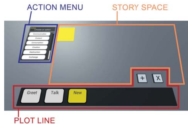
Fig. 1. Overview of the Story ARTist work area and interface

In Story ARTist, a story line consists of a sequence of plot points, each one representing a single action. When a new plot point is created, an action needs to be chosen and the plot point has to be filled with information related to that action. Once