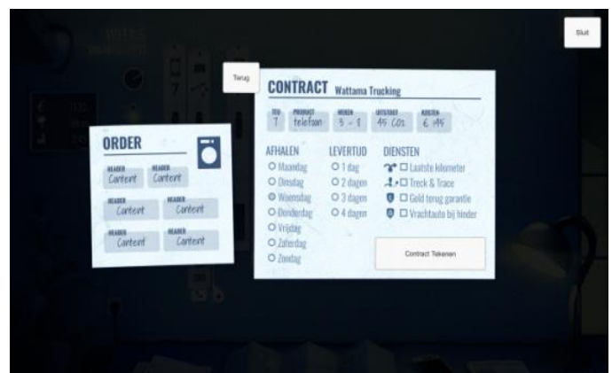
FIGURE 2. ORDERS AND SERVICES

The player is assessed based on the number of delayed shipments, the number of products he/she managed to deliver on time, the workload for organising the transport and the emissions generate by the transport design. Workload is one of the main