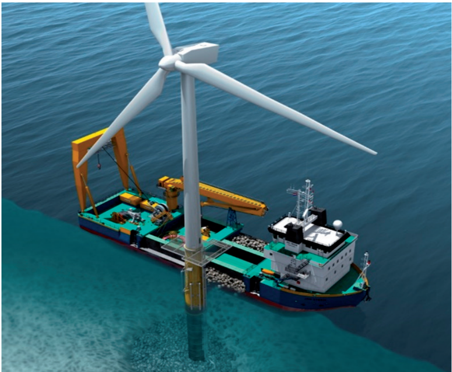
Figure 4. Scour protection around monopiles: opportunity for habitat creation?

Depending on the situation, waves and currents may necessitate the seabed around the substructure (mostly monopiles) to be protected against scour, usually by a rock filter ( figure 4 ). The design of these filters used to be based exclusively on technical and financial grounds, but in light of the 2018 requirement it has become attractive to explore how they can contribute to ecosystem rehabilitation.