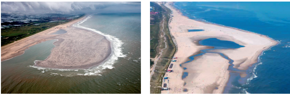
Figure 2. The Sand Motor; left: after placement in 2011; right: in 2017.

The operational objective of each maintenance nourishment is to locally prevent structural coastal erosion. The volume of an individual nourishment was typically 1–5 million m 3 , which was sufficient to achieve the operational objective for a period of 3–5 years. The Delta Committee (2008), however, anticipated a significant increase in nourishment volumes, from the present 10 million m 3 /year to 40 – 85 million m 3 /year, depending on the rate of sea level rise. This might necessitate larger nourishments and/or new nourishment methods. In line with the BwN-philosophy, the idea emerged to concentrate the regular nourishments in space and time, relying on natural processes (currents, waves) to distribute the sediment over the wider coastal system. As compared with smaller-scale nourishments repeated every 3 to 5 years, utilising this ecosystem service was expected to achieve the operational objective in a more sustainable manner. It was expected to reduce the ecological and CO 2 footprint of the nourishment policy while creating opportunities for recreation and nature development, thus providing ecosystem services and addressing additional operational objectives .