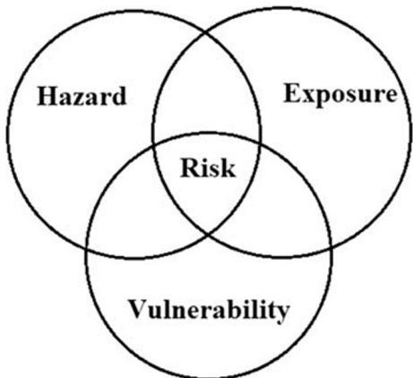
Fig. 2 Intersection of hazard, exposure, and vulnerability yielding the risk (IPCC 2014)

In the context of natural hazards, “risk” represents the probability of a hazard. It depends not only on the hazard itself occurring in a given region but also on the exposure and vulnerability