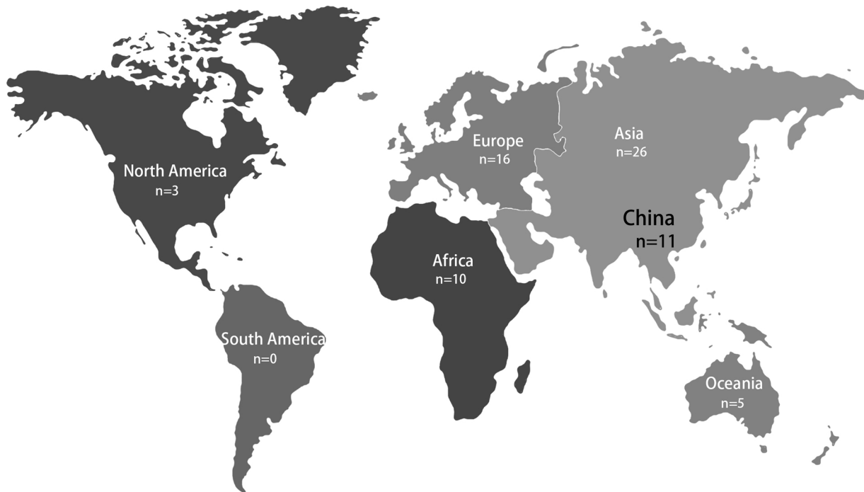
Fig. 1. Geographical distribution of the case studies by continents.

Furthermore, the participation of Chinese businesses reaches almost half of the cases (43 percent), compared to the international cases (18 percent). Businesses play an important role in the profit-driven processes of decision-making in China, which is in line with the government’s expectations.