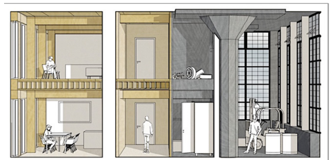
Figure 4. Symbiotic working and living (detail) .

characters based on interviews with many professionals in the area. That led him to suggest a radical co-habitation of living and working environments. His design proposal advocated for the absolute extinction of commute time and space, by creating high-rises that bring apartments and workshops next to each other (Fig. 4). He selected the three most prominent professions to be found in the area—heavy industry, delicate production, creative businesses—and designed for those a symbiotic living and working that eliminates the threshold between the two activities, interconnecting them in a dense and productive fashion that promotes the sharing of facilities. It was not a coincidence that during the typological studies, Maarten had explored in depth one of the first apartment buildings of the Hague with shared facilities rooms (laundry, garbage collection, etc.). Proceeding with his design, Maarten looked thoroughly into the functional needs of each selected profession and the social norms of the professionals involved. He created spatial conditions tailored to them specifically. His high-rise proposal was meant to invigorate the local character of the area and allow services and industries to better serve the whole city, thus becoming a vital part of the Hague.