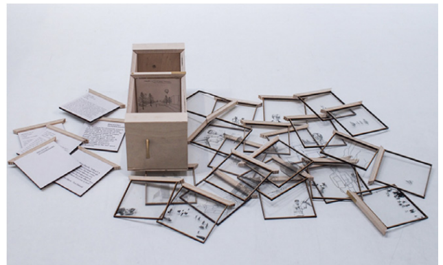
Figure 2. Binckhorst’s Wundercamera.

idea of a wundercamera, a box of wonders, created a box with slides. The slides included information based on four categories: stories and habits of the characters, slides with historical moments of the area, slides capturing characteristic landmarks of Binckhorst, and slides with atmospheric aspects. Random and spontaneous arrangements of the various slides could lead to new interconnections and activities in place. The “Binckhorst Wundercamera” was an open-ended device, as the students’ intention was to add new slides in the future (following the rapid transformation of Binckhorst) or remove existing slides if they were not capturing the identity of the place any more (Fig. 2). With the stage of “Transcription” completed, the studio moved to the third and last mode, that of “Prescription”.