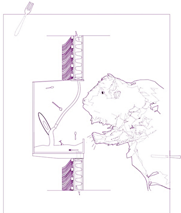
Figure 5. Surreal moments of everyday life.