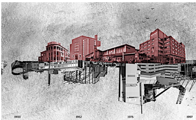
Figure 1. The different temporalities of Binckhorst.

development, the history of its architecture, the place's physical elements and materiality, the immaterial characteristics and the prevalent atmospheres. The assignments were designed to cultivate the students' observational as well as creative skills. Observations and analysis about Binckhorst had to be synthesized in imaginative and creative ways to be communicated in class. Engaging the place's history for example and examining old habits and customs that influenced space and its appropriation, the students experimented with drawings that like palimpsests incorporated aspects from different time periods. Elements and activities from the past appeared in different and complementary directions on the same surface, literally layering on the same drawing many different temporalities (Fig. 1).